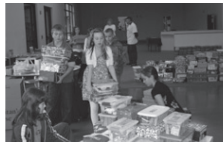
Loading the boxes

Operation Christmas Child is a project operated by Samaritan's Purse where churches, schools, and other organizations collect shoeboxes filled with toys, school supplies, personal items, and other gifts. These boxes, accompanied by the message of God's love and