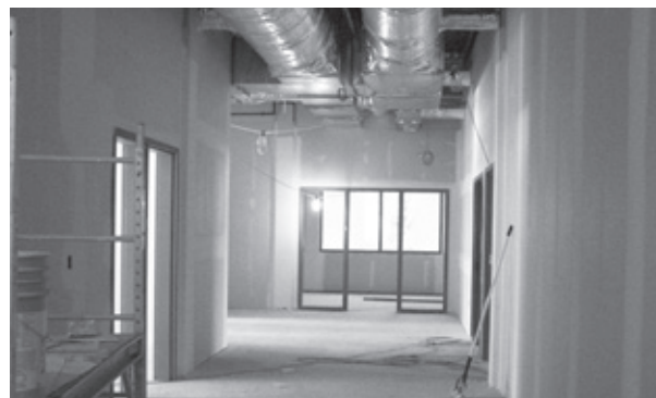
Second floor construction

*Please call us if you would like more information or you are interested in sponsoring a room or materials. Call 541-745-5524, ext. 244.